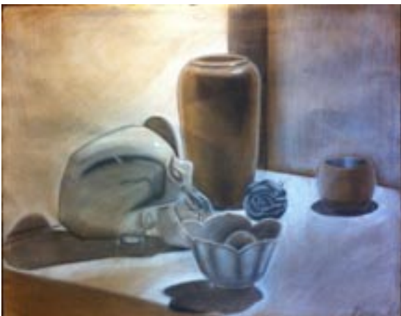
Xavier Richardson class of 2012 Hatch-marks example with black and white charcoal

Challenge: Select a view with at least 5 objects in it. Consider reflective surfaces and challenging objects to draw.