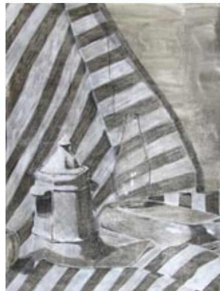
Rodney MacCaulley class of 2010 Hatch-marks example with black and white charcoal and ink wash)