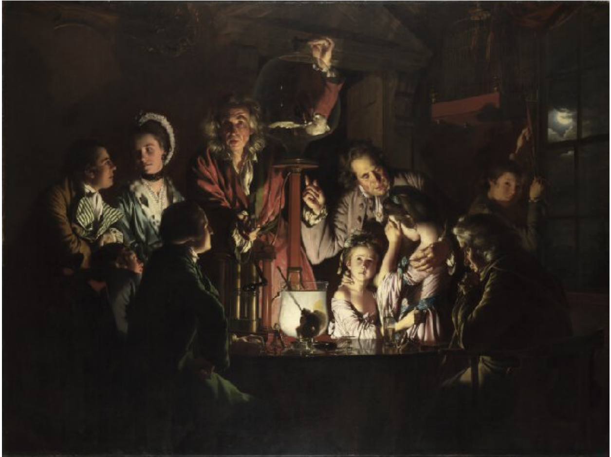
An Experiment on a Bird in the Air Pump