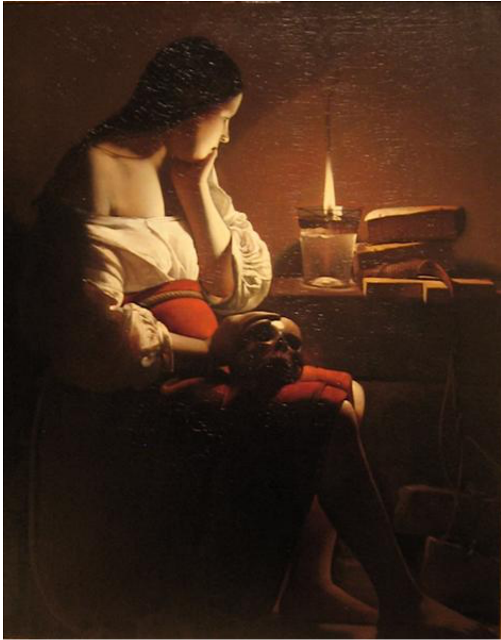
Repenting Magdalene , Georges de la Tour c. 1635-37