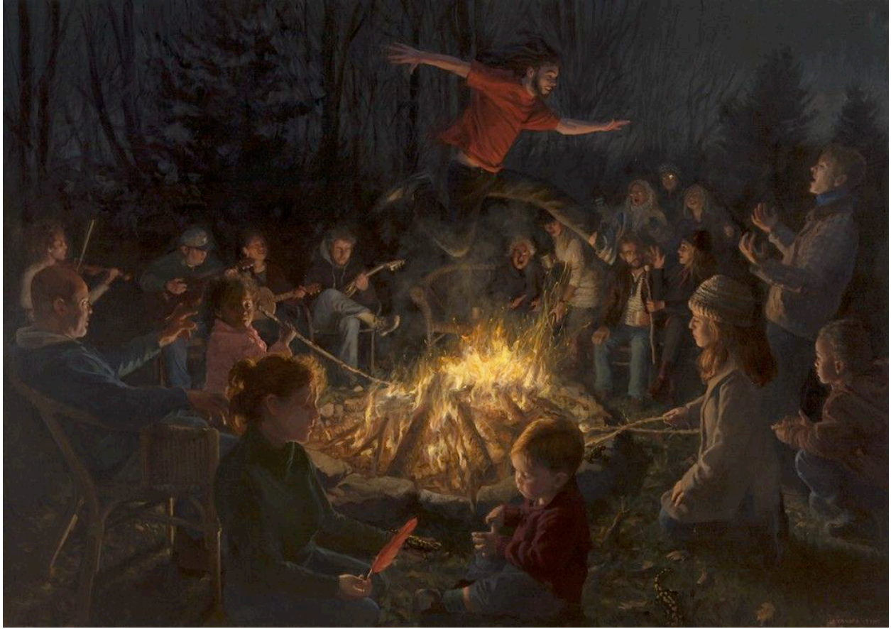
Triumph of Light , 2017 Alex Tyng

Does this piece show the use of chiaroscuro? Why or why not?