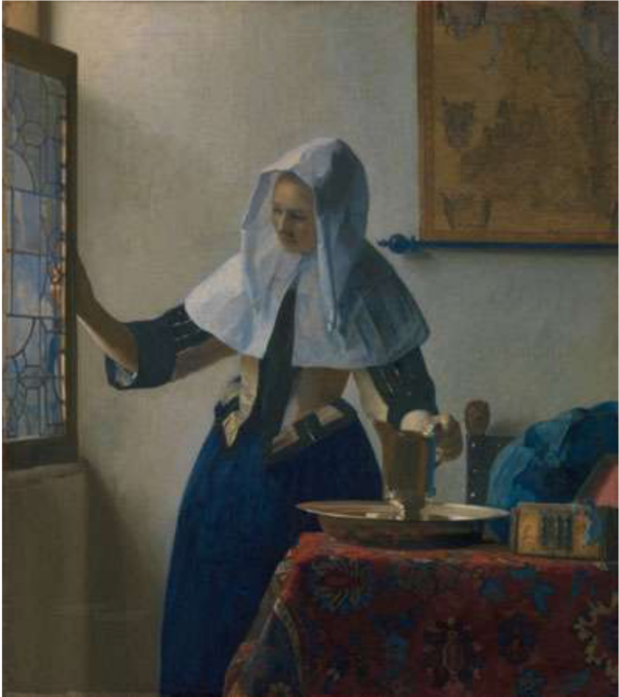
Young Woman with a Water Pitcher, Johannes Vermeer, 1662